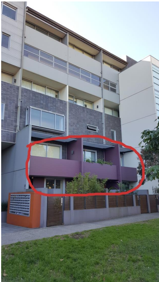
External wall: (Building 2 and 3)

The painting committee agreed that the exterior colours of the Mondrian should essentially be retained, whereas the purple colour (plum) on parts of Buildings 2 and 3 should be changed to something more in keeping with the adjacent brick tile finishes.